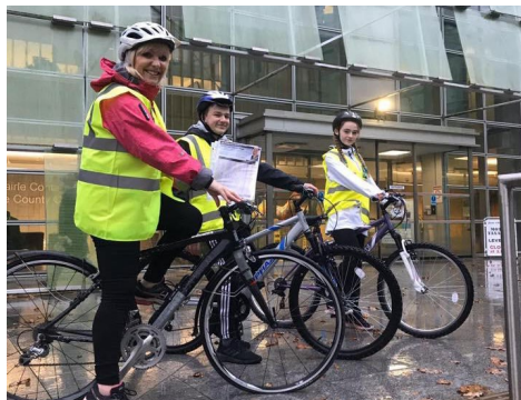
Delivering a petition for a cycle lane between Caragh and Naas to the Council

I have lobbied the NTA to consider all options open to them to deliver extra rail carriages for commuters to address overcrowding on trains from Portllington and Kildare and the punitive cost of commuter tickets from Newbridge. The NTA committed to consider all options, including the possibility of sourcing of safe, second hand rail carriages rather than waiting for the delivery of new carriages at some point after 2021.