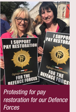
Protesting for pay restoration for our Defence Forces