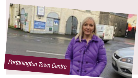
Portllington Town Centre