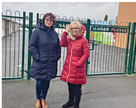
With area engineer outside Scoil Eimhin Naofa Monasterevin