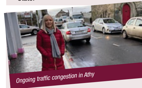
Ongoing traffic congestion in Athy